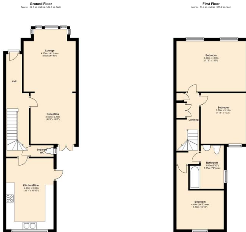
Total area: approx. 104.3 sq metres (1122.4 sq. feet)